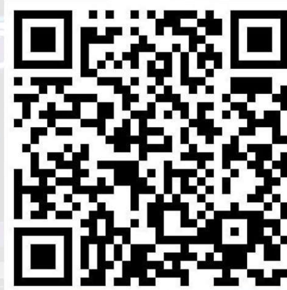
Gratuitous LinkedIn QR code.

"Most likely to create demo videos that receive malicious DMCA takedowns"